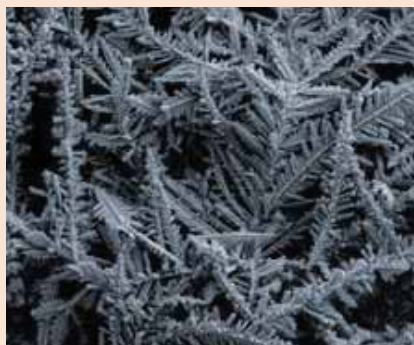
Thermal diode.

A thermal diode allows heat to flow in only one direction, analogous to the way in which a conventional electronic diode lets electrical current flow only one way. However, solid-state thermal diodes are not as effective as those that exploit phase change involving vaporization or condensation to transport heat. Currently available phase-change thermal diodes transfer heat in one direction 100 times more effectively than the reverse, but usually rely on gravity to drip the condensate down. This essentially precludes their use in portable electronics devices where the appropriate orientation cannot be guaranteed, preventing the recycling of the working fluid by dripping. Such gravitational thermal diodes, or thermosyphons, are exploited in Alaskan oil pipelines to prevent the heat in the pipes from melting the permafrost.